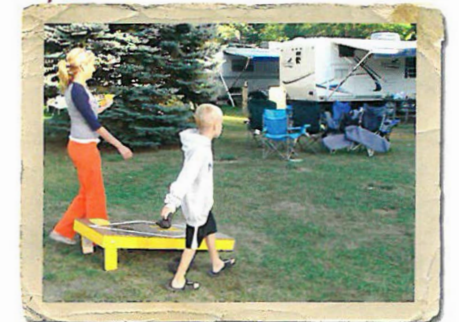
Coldwater Lake Family Park