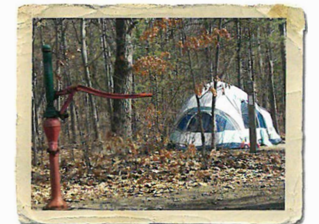
Deerfield Nature Park