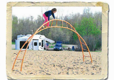
Herrick Recreation Area